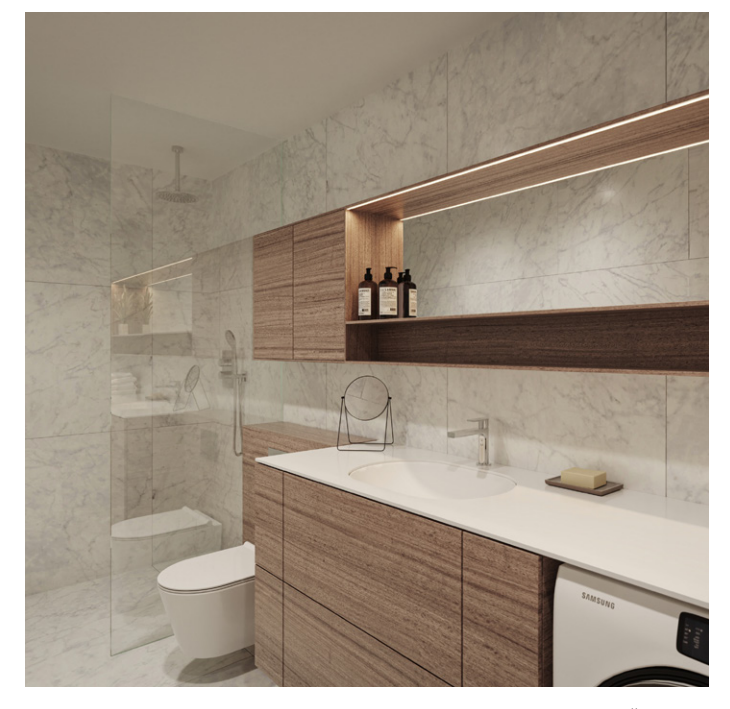
Interior pictures are illustrative