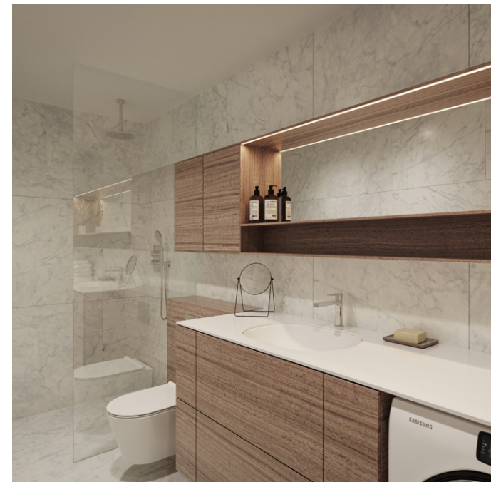
Interior pictures are illustrative