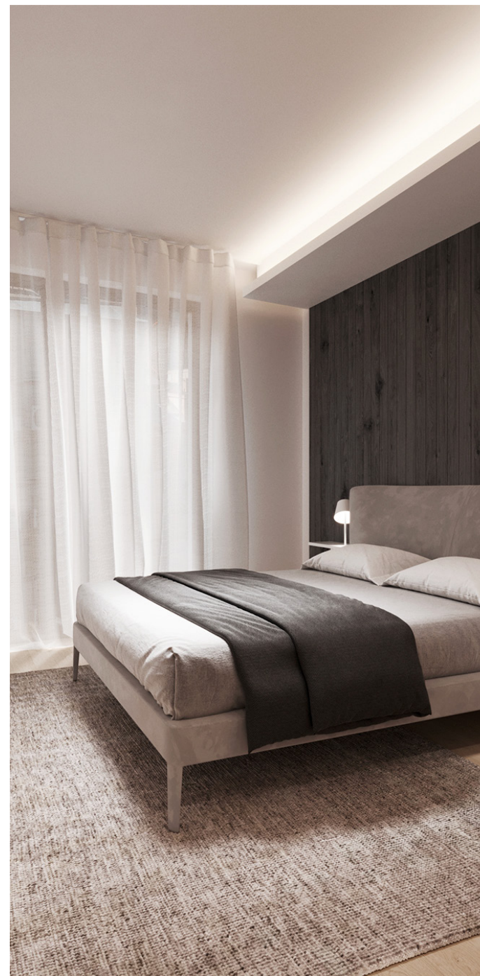
The picture is illustrative